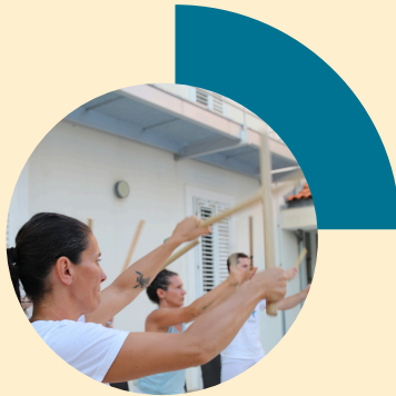
Music & culture